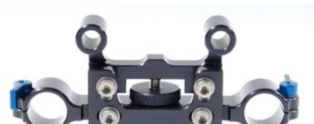
Adaptor 401-17 for 19mm rods with horizontally and vertically adjustable mounts for 15mm rods