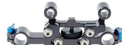
Adaptor 401-18 for 15mm rods with film spacing (401-122), horizontally and vertically adjustable mounts for 15mm video standard.