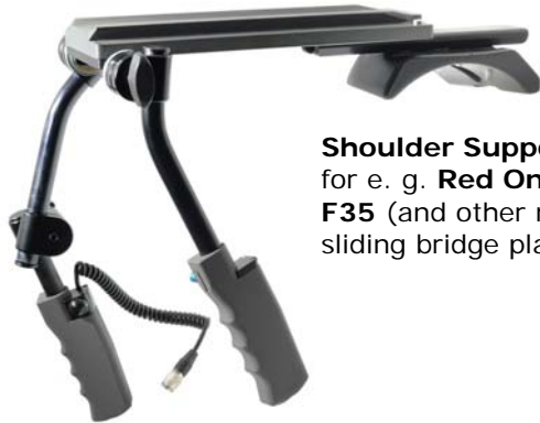
Shoulder Support 403-240 for e. g. Red One, Sony F23 / F35 (and other mounted on a sliding bridge plate).