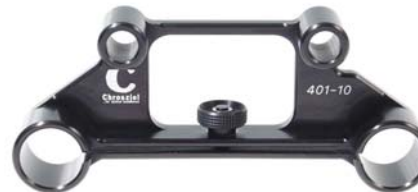
Adaptor 401-10 for 19mm rods with centred mounts to 15mm rods