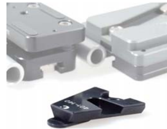
Mini wedge plate 401-140 connects the DV light-weight supports of the 401-400 series with the QuickLock tripod plate.