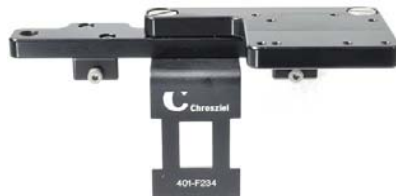
Universal Accessory Mount 401-F234 for Sony F23 / F35, holds the control panel and the studio viewfinder HDVF C750.