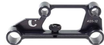
Adaptor 401-12 for 15mm rods with film spacing (401-122) to 15mm video standard.