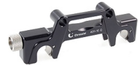
Adaptor 401-10Q quick connector for 19mm rods with centred mounts to 15mm video standard.