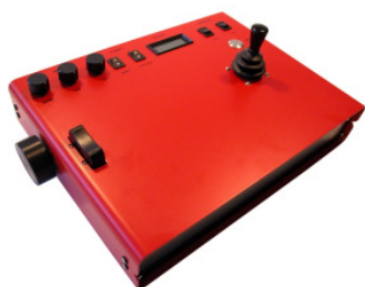
Control panel with its integrated joystick